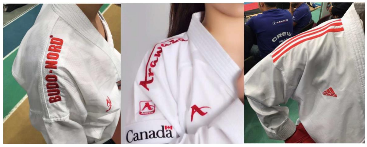
(Examples of red colour shoulder embroidery)

The wearing of karate-gis featuring blue, red or white shoulder embroidery by competitors will therefore be accepted. The wearing of karate-gis featuring gold shoulder embroidery is only permitted for current, reigning WKF world champions, where applicable (no other color will be permitted).