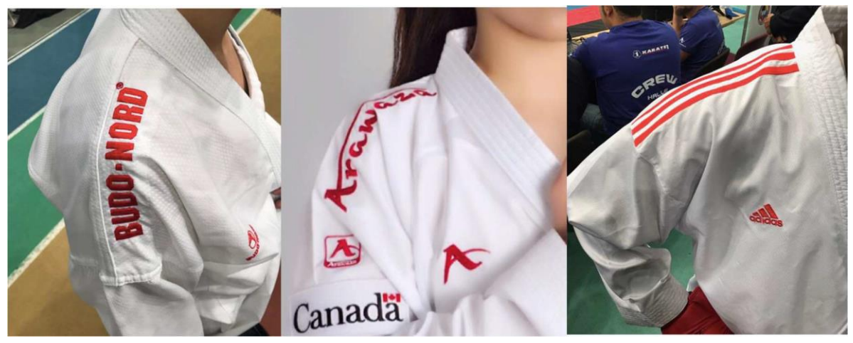
(Examples of red colour shoulder embroidery)

The wearing of karate-gis featuring blue, red or white shoulder embroidery by competitors will therefore be accepted. The wearing of karate-gis featuring gold shoulder embroidery is only permitted for current, reigning WKF world champions, where applicable (no other color will be permitted).