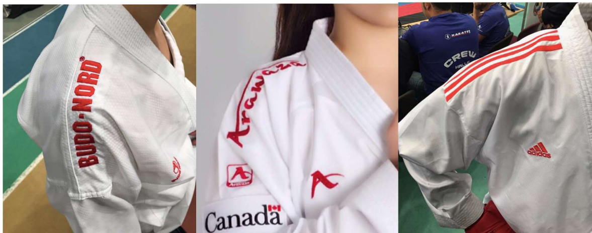
(Examples of red colour shoulder embroidery)

The wearing of karate-gis featuring blue, red or white shoulder embroidery by competitors will therefore be accepted. The wearing of karate-gis featuring gold shoulder embroidery is only permitted for current, reigning WKF world champions, where applicable (no other color will be permitted).