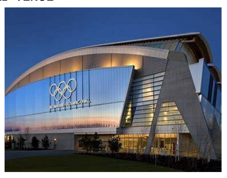
RICHMOND OLYMPIC OVAL 6111 River Rd